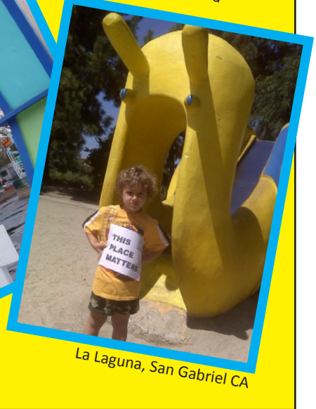
La Laguna, San Gabriel CA