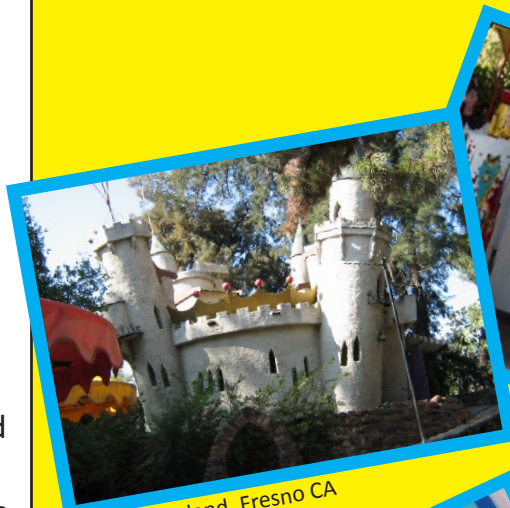
Rotary Storyland, Fresno CA