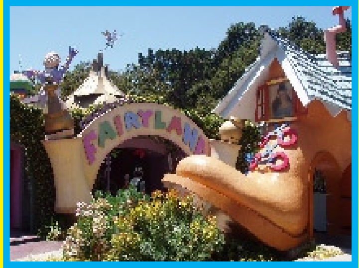
Fairyland, Oakland CA

NATIONAL TRUST FOR HISTORIC PRESERVATION